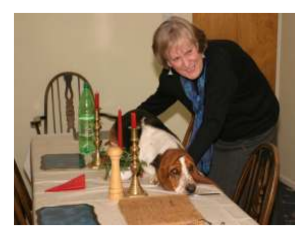
Saves clearing the table after guests